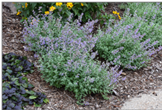
Purrsian Blue Catmint in bloom