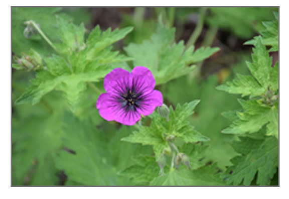
Perfect Storm Cranesbill flowers