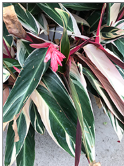
Tricolor Stromanthe flowers

This is a dense spreading evergreen houseplant with an upright spreading habit of growth. Its relatively coarse texture stands it apart from other indoor plants with finer foliage. This plant should not require much pruning, except when necessary to keep it looking its best.