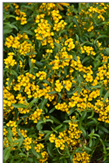
Mexican Tarragon flowers

Mexican Tarragon will grow to be about 30 inches tall at maturity, with a spread of 18 inches. Its foliage tends to remain dense right to the ground, not requiring facer plants in front. Although it's not a true annual, this plant can be expected to behave as an annual in our climate if left outdoors over the winter, usually needing replacement the following year. As such, gardeners should take into consideration that it will perform differently than it would in its native habitat.