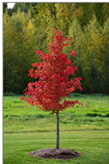
Wildfire Black Gum in fall