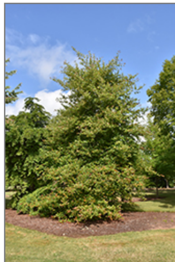
Wildfire Black Gum