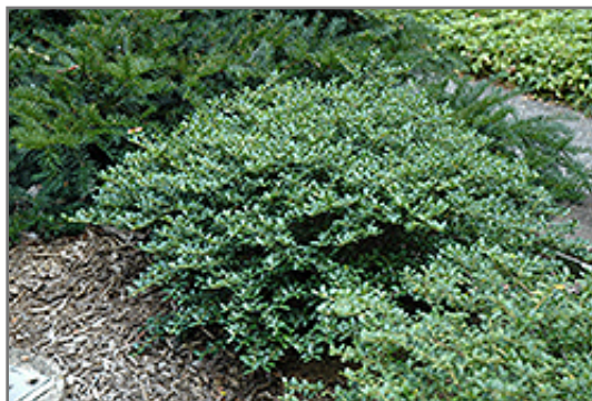
Helleri Japanese Holly