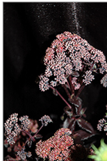
Orbit Bronze Stonecrop flowers