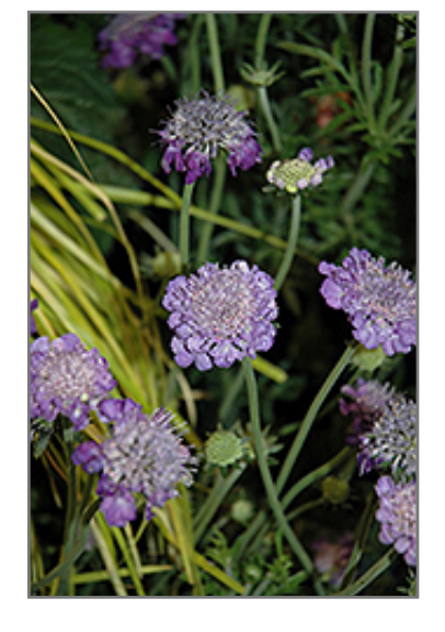
Mariposa Violet Pincushion Flower flowers