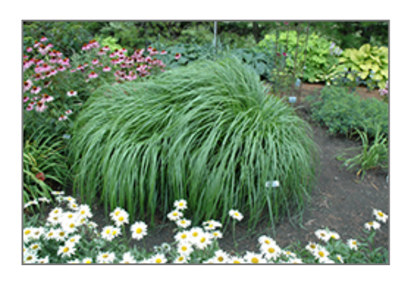
Red Head Fountain Grass

Red Head Fountain Grass is recommended for the following landscape applications;