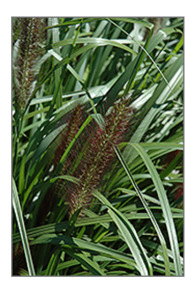
Red Head Fountain Grass foliage