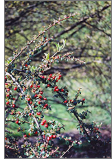
Coral Beauty Cotoneaster fruit

This shrub does best in full sun to partial shade. It is very adaptable to both dry and moist growing conditions, but will not tolerate any standing water. It is not particular as to soil pH, but grows best in rich soils, and is able to handle environmental salt. It is highly tolerant of urban pollution and will even thrive in inner city environments. Consider applying a thick mulch around the root zone in winter to protect it in exposed locations or colder microclimates. This is a selected variety of a species not originally from North America.