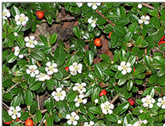
Coral Beauty Cotoneaster fruit

Coral Beauty Cotoneaster will grow to be about 12 inches tall at maturity, with a spread of 5 feet. It tends to fill out right to the ground and therefore doesn't necessarily require facer plants in front. It grows at a fast rate, and under ideal conditions can be expected to live for approximately 30 years.