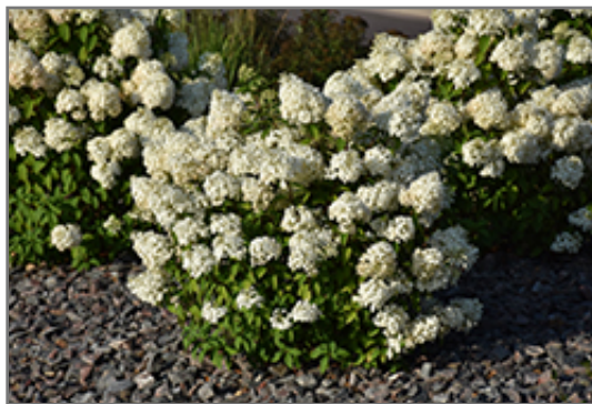
Bobo Hydrangea in bloom