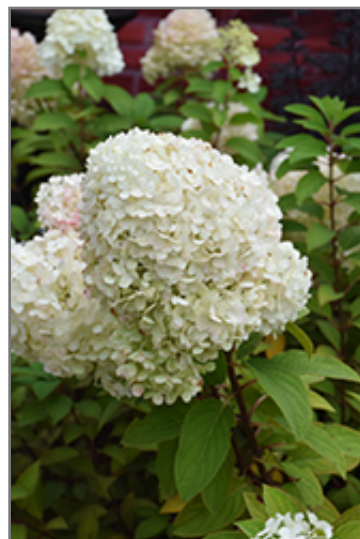
Bobo Hydrangea flowers