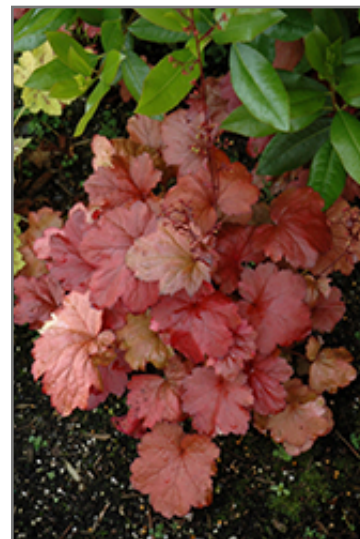
Galaxy Coral Bells