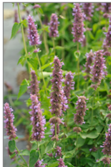
Blue Boa Hyssop flowers