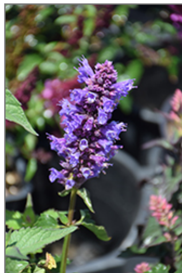
Blue Boa Hyssop flowers

Blue Boa Hyssop is a fine choice for the garden, but it is also a good selection for planting in outdoor pots and containers. With its upright habit of growth, it is best suited for use as a 'thriller' in the 'spiller-thriller-filler' container combination; plant it near the center of the pot, surrounded by smaller plants and those that spill over the edges. Note that when growing plants in outdoor containers and baskets, they may require more frequent waterings than they would in the yard or garden.