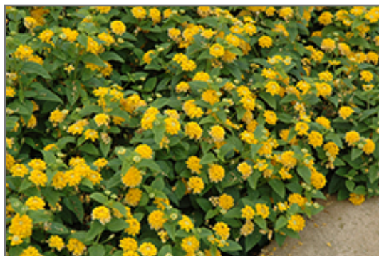
Little Lucky Pot Of Gold Lantana flowers