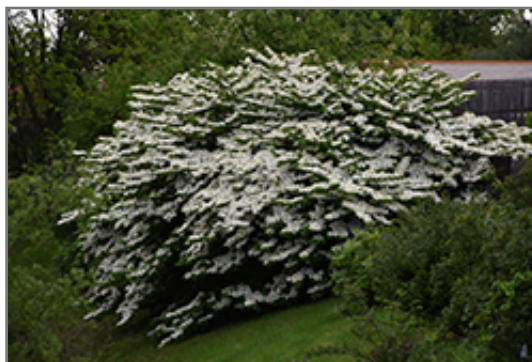
Maries Doublefile Viburnum in bloom

Maries Doublefile Viburnum is recommended for the following landscape applications;