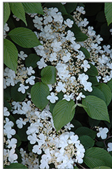
Maries Doublefile Viburnum flowers