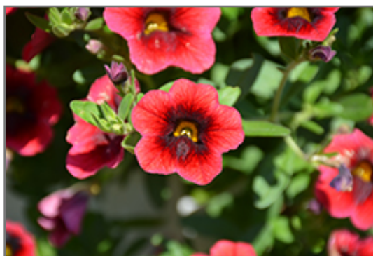
Superbells Pomegranate Punch Calibrachoa flowers