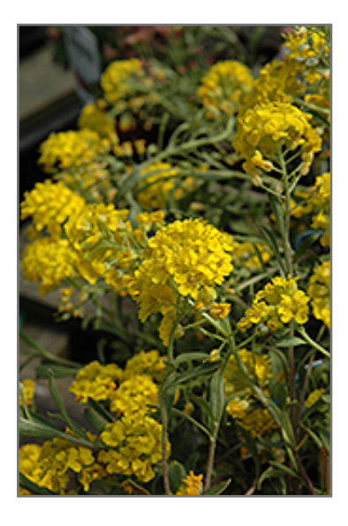
Alpine Alyssum flowers

This hardy variety is perfect for edging a sunny border or accenting a rock garden; yellow flower clusters appear above a mounded cushion of leaves in mid to late spring; evergreen in mild winter areas and drought tolerant once established