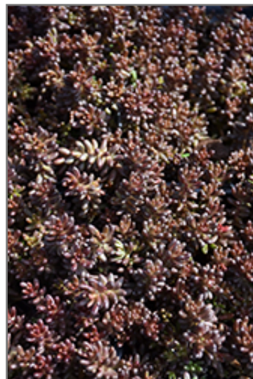
Murale Stonecrop foliage