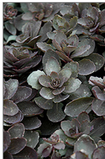
Dazzleberry Stonecrop foliage