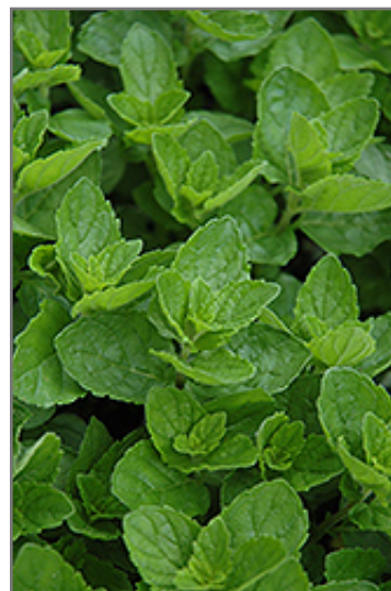
Spearmint foliage