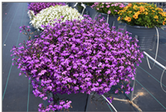
Techno Heat Violet Lobelia in bloom