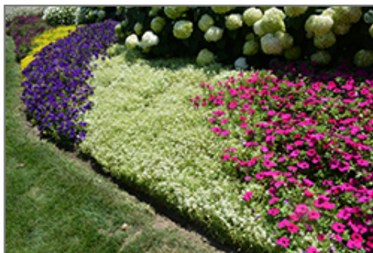
Frosty Knight Alyssum in bloom

Frosty Knight Alyssum is a fine choice for the garden, but it is also a good selection for planting in hanging baskets. Because of its trailing habit of growth, it is ideally suited for use as a 'spiller' in the 'spiller-thriller-filler' container combination; plant it near the edges where it can spill gracefully over the pot. Note that when growing plants in outdoor containers and baskets, they may require more frequent waterings than they would in the yard or garden.