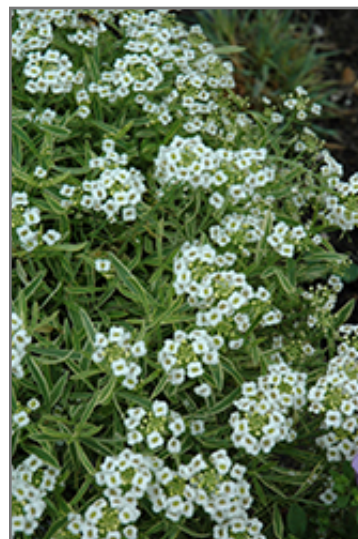
Frosty Knight Alyssum flowers

Frosty Knight Alyssum is recommended for the following landscape applications;