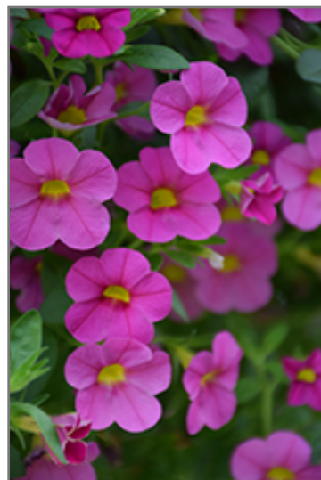
Superbells Pink Calibrachoa flowers

Superbells Pink Calibrachoa is recommended for the following landscape applications;