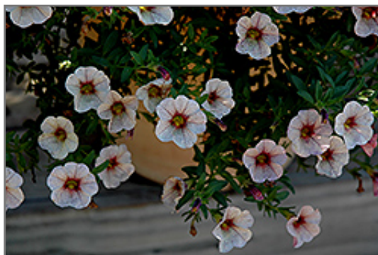
Celebration Mozart Calibrachoa flowers