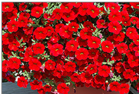
Cabaret Bright Red Calibrachoa flowers

This plant will require occasional maintenance and upkeep. Trim off the flower heads after they fade and die to encourage more blooms late into the season. It is a good choice for attracting bees and hummingbirds to your yard, but is not particularly attractive to deer who tend to leave it alone in favor of tastier treats. It has no significant negative characteristics.