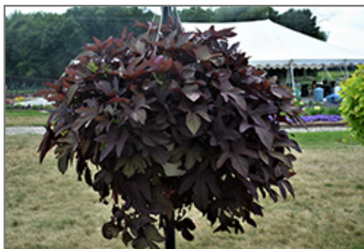
Sweet Caroline Red Sweet Potato Vine