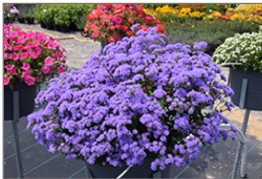
Artist Blue Flossflower in bloom