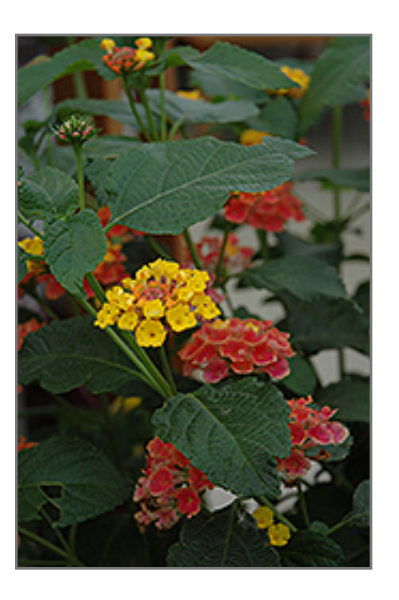
Confetti Lantana flowers