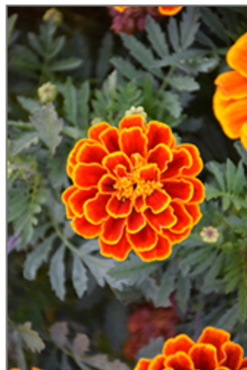
Durango Flame Marigold flowers