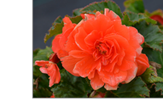
Nonstop Salmon Begonia flowers

Moana Lane Garden Center & Corporate Office South Virginia St. Garden Center 1100 W. Moana Lane Reno, NV 89509 (775) 825-0600 (775) 825-0602 - Corporate Office