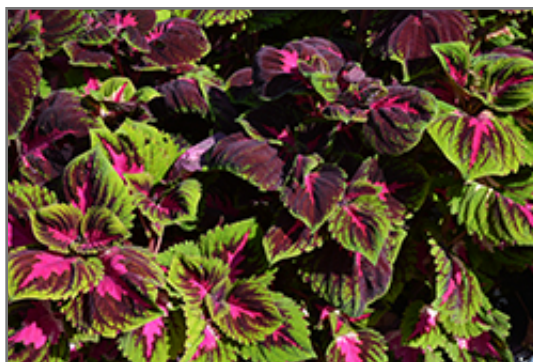
Kong Red Coleus foliage