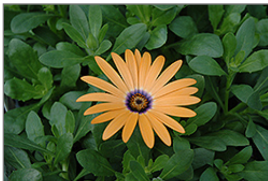
Orange Symphony African Daisy flowers