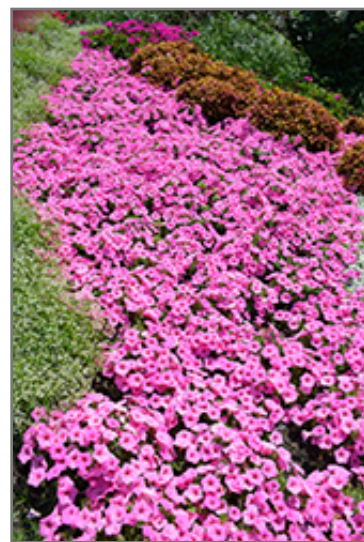
Supertunia Vista Bubblegum Petunia in bloom