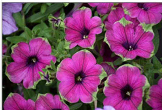
Supertunia Pretty Much Picasso Petunia flowers