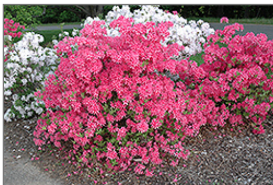
Rosy Lights Azalea in bloom