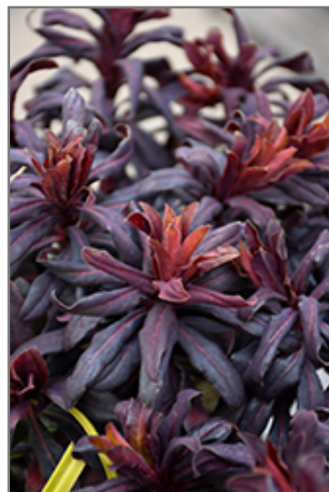
Ruby Glow Wood Spurge flowers

Ruby Glow Wood Spurge is recommended for the following landscape applications;