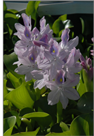
Water Hyacinth flowers