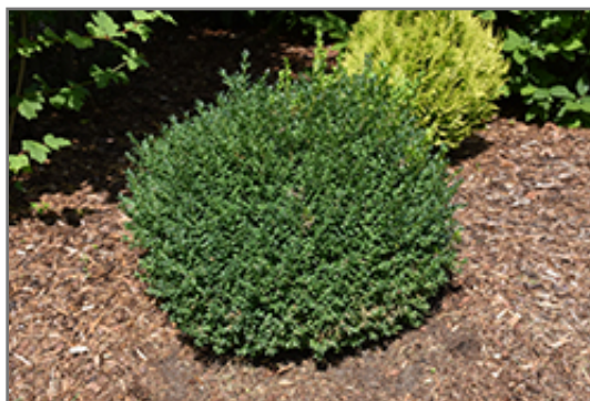
North Star Boxwood