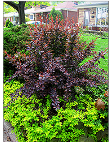
Red Leaf Japanese Barberry

Red Leaf Japanese Barberry is recommended for the following landscape applications;