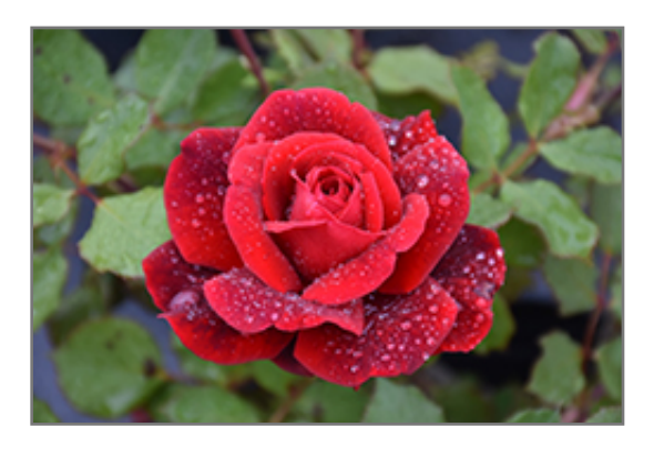
Don Juan Rose flowers