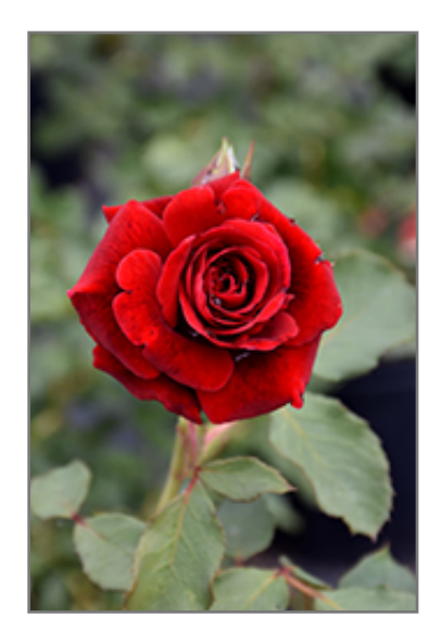
Don Juan Rose flowers