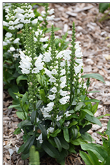
Crystal Peak White Obedient Plant in bloom