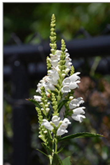
Crystal Peak White Obedient Plant flowers

Crystal Peak White Obedient Plant is recommended for the following landscape applications;