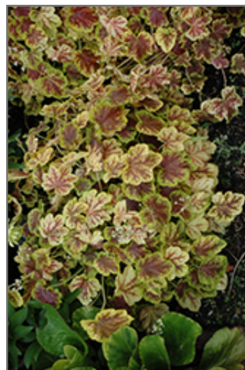
Solar Eclipse Foamy Bells