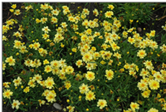
Galaxy Tickseed in bloom