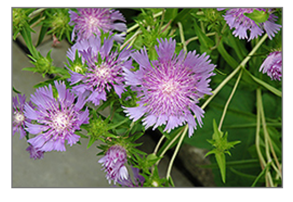
Stoke's Aster flowers