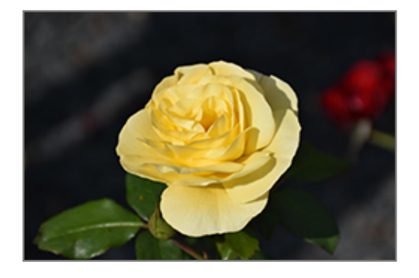
High Voltage Rose flowers

High Voltage Rose is recommended for the following landscape applications;