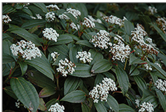
David Viburnum flowers