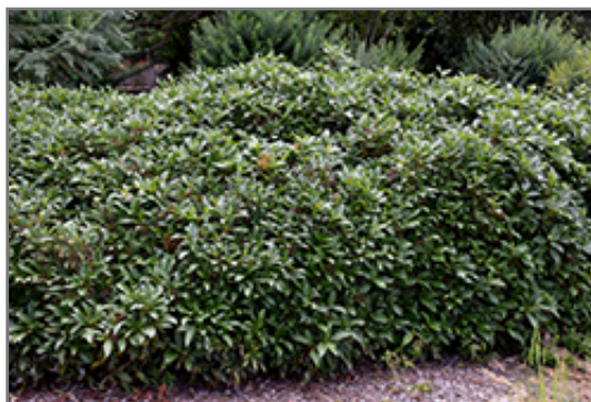
David Viburnum

David Viburnum will grow to be about 4 feet tall at maturity, with a spread of 4 feet. It tends to fill out right to the ground and therefore doesn't necessarily require facer plants in front. It grows at a medium rate, and under ideal conditions can be expected to live for 40 years or more. This is a female variety of the species which requires a male selection of the same species growing nearby in order to set fruit.